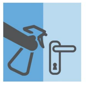
CLEAN AND DISINFECT "HIGH-TOUCH" SURFACES OFTEN